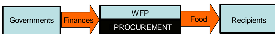
FIGURE 1 Status of Procurement in the Entire WFP Activities

To pursue above purpose, the main questions are as follows. First, what are WFP and its main components of procurement, and why procurement is important for WFP as a whole? Second, what kinds of administrative measures and efforts are underway in its procurement operations? Third, what are important external actors for WFP procurement, and what kinds of relations does WFP establish with them? By exploring these three, considerable parts, though not every aspect, of WFP procurement are expected to be covered.